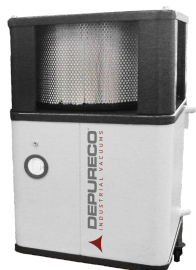
POST H Post-Cartridge