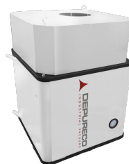
PRE H Pre-Cartridge